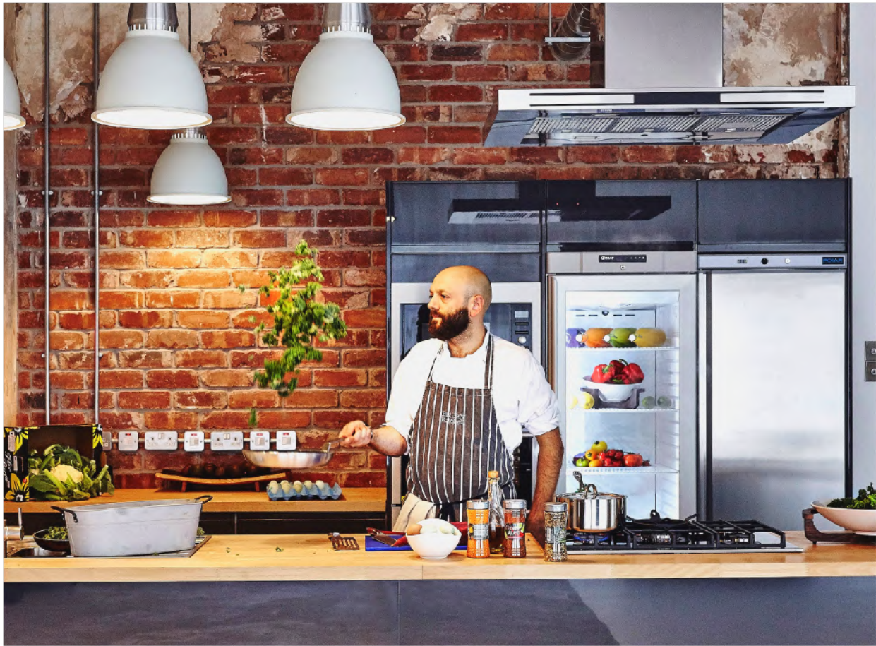
Food styling and prep