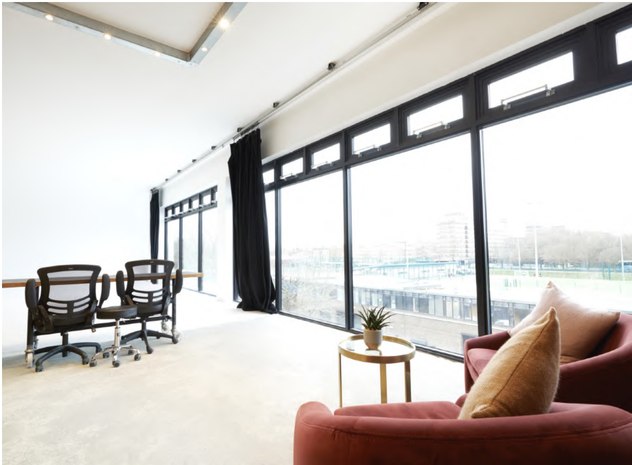
Natural daylight windows