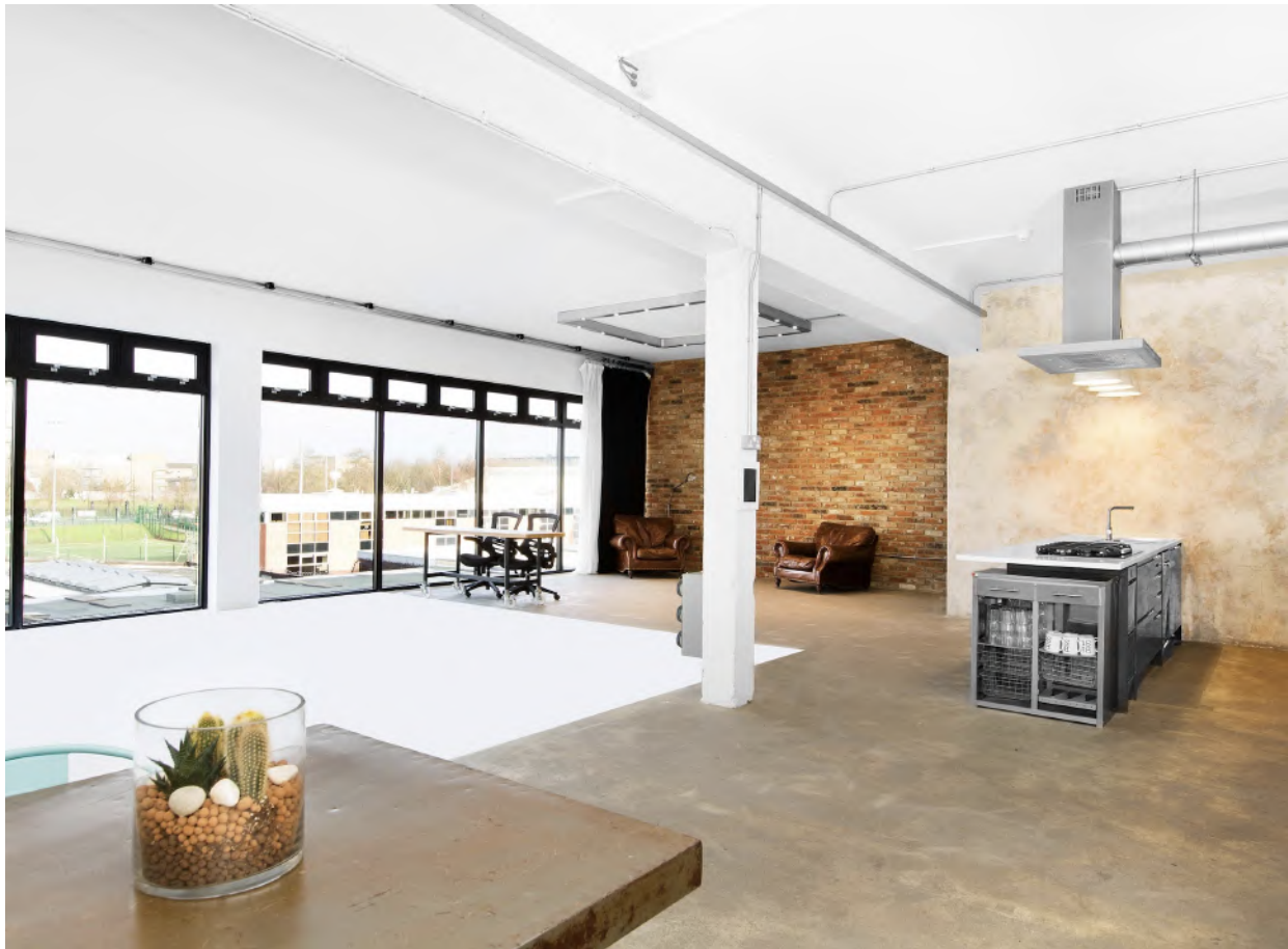
Exposed brick wall